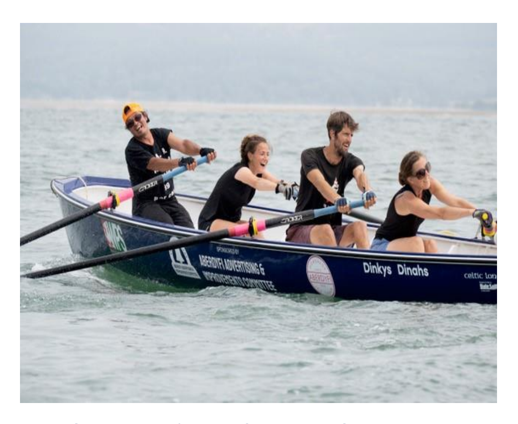
Finally keep safe and enjoy your boating.